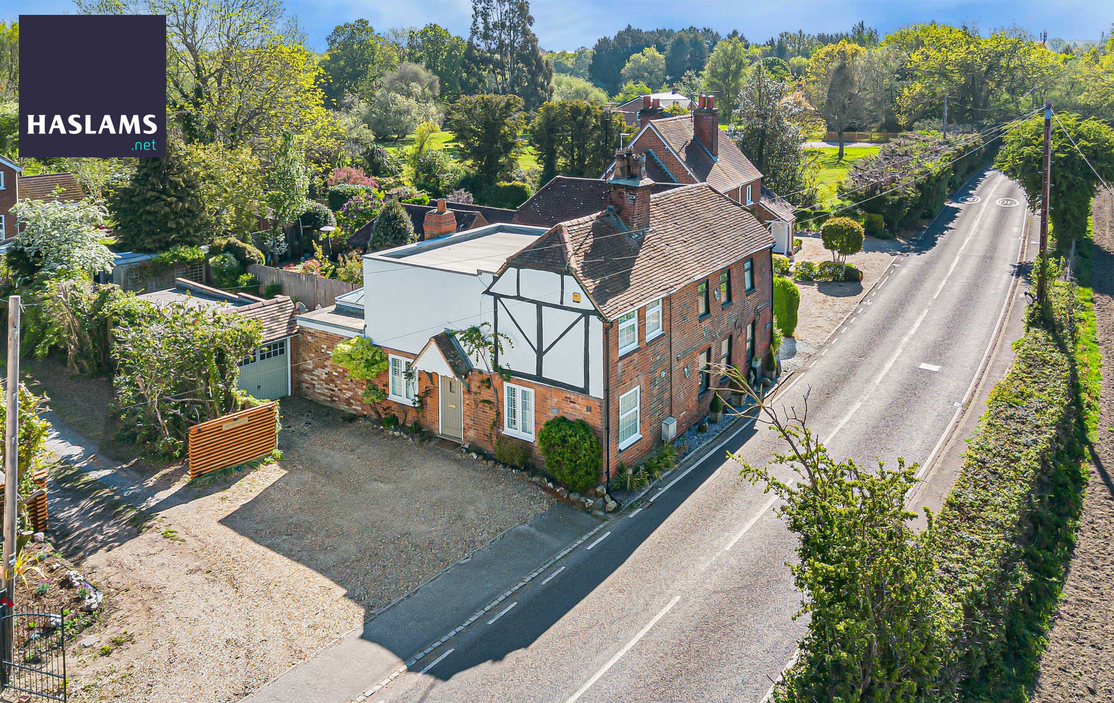
Chain Cottage, Wokingham Road, Reading, RG10 0RU